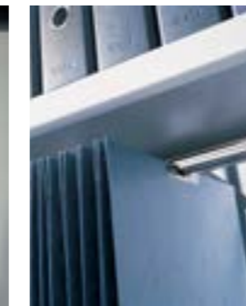
ZT pendel frame