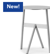
Stock Table H: 46 x D: 37,5 x Ø37 cm