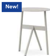
Stock Table H: 46 x D: 37,5 x Ø37 cm