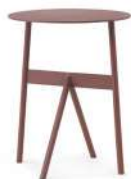
Stock Table H: 46 x D: 37,5 x Ø37 cm