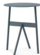
Stock Table H: 46 x D: 37,5 x Ø37 cm