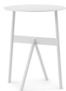
Stock Table H: 46 x D: 37,5 x Ø37 cm