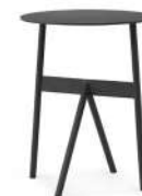
Stock Table H: 46 x D: 37,5 x Ø37 cm