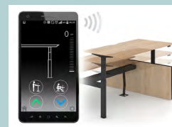
App control via Bluetooth (iOS, Android)