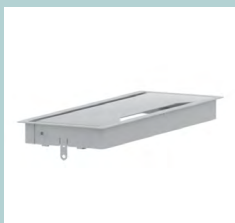
Metal grommet: 317x119 mm, H=27 mm