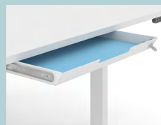
Felt-lined metal drawer with lock